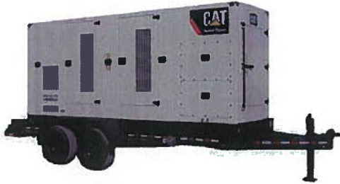
*Shown with optional trailer